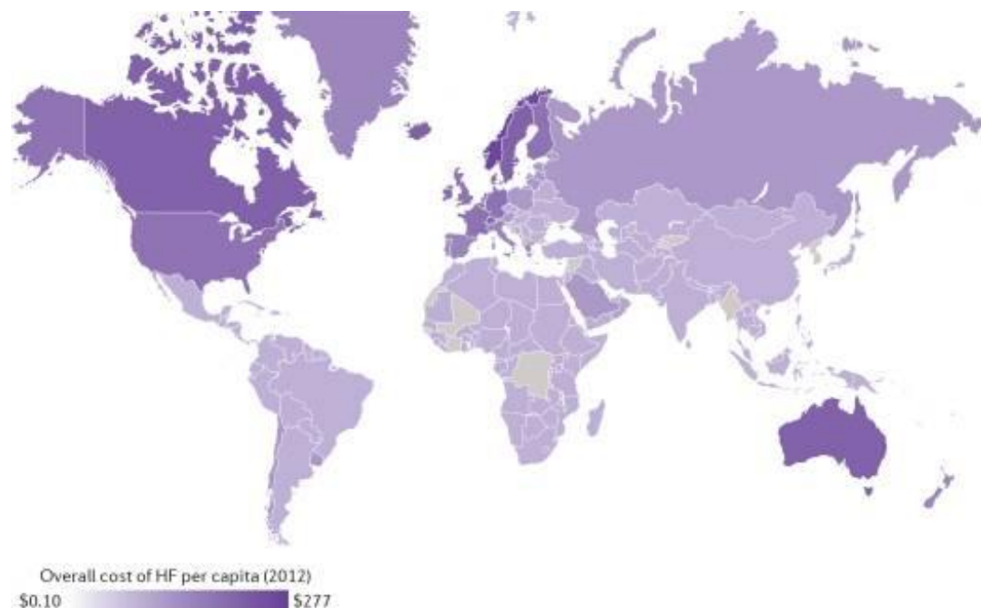
Figure 1. Costs of heart failure globally.

In a study from 2014 an estimation of 108 billion USD was spent on heart failure globally in 2012 of which 60% was direct medical costs (5). Eighty-six percent of this global expenditure was from higher income regions which only make up for 18% of the global population (Figure 1). Considering the predicted increase of hospitalizations due to heart failure we can estimate that the global expenditure will also increase over time. In Europe the estimation is an increase of cost due to cardiovascular disease from 102 billion euro in 2014 to 122 billion Euro by 2020 (6). In the USA as of 2011 estimated lifetime cost of heart failure per individual patient was 110,000 /year with more than three-fourths of this consumed by in-hospital care (7).