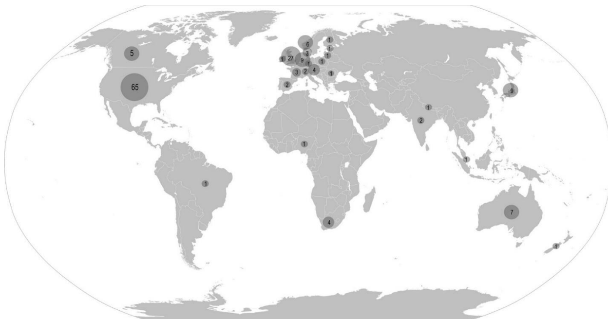
Fig. 2 Origin of practices by country (without international practices; number of international practices n=52). The United States of America (n=65), United Kingdom (n=27), Japan (n=9), the Netherlands (n=9), Australia (n=7), Norway (n=6), Canada (n=5), Austria (n=4), South Africa (n=4), Denmark (n=3), France (n=3), India (n=2), Spain (n=2), Switzerland (n=2), Brazil (n=1), Estonia (n=1), Finland (n=1), Germany (n=1), Ireland (n=1), Lithuania (n=1), Nepal (n=1), New Zealand (n=1), Nigeria (n=1), Poland (n=1), Romania (n=1), Singapore (n=1). There were 52 documents which were international and could not be located to a single country.

countries, but instead could be applicable internationally (n=50). Some examples of the practices that we mapped as international are Responsible Conduct in the Global Research Enterprise: A Policy Report by Inter Academy Council and the Inter Academy Partners (IAC and IAP 2012), World Health Organisation Guidelines for Good Clinical Practice for Trials on Pharmaceutical Products (WHO 1995) European Science Foundation Good scientific practice in research and scholarship (ESF 2000), and the Hong Kong Principles for Assessing Researchers: Fostering Research Integrity (Moher et al. 2019). Some documents contained the descriptions of practices related to more than one country, i.e. two or more countries were explicitly mentioned. In those cases, we included all the mentioned countries in the analysis. The origin of practices by country and the number of identified sources related to a particular country are presented in Fig. 2 .