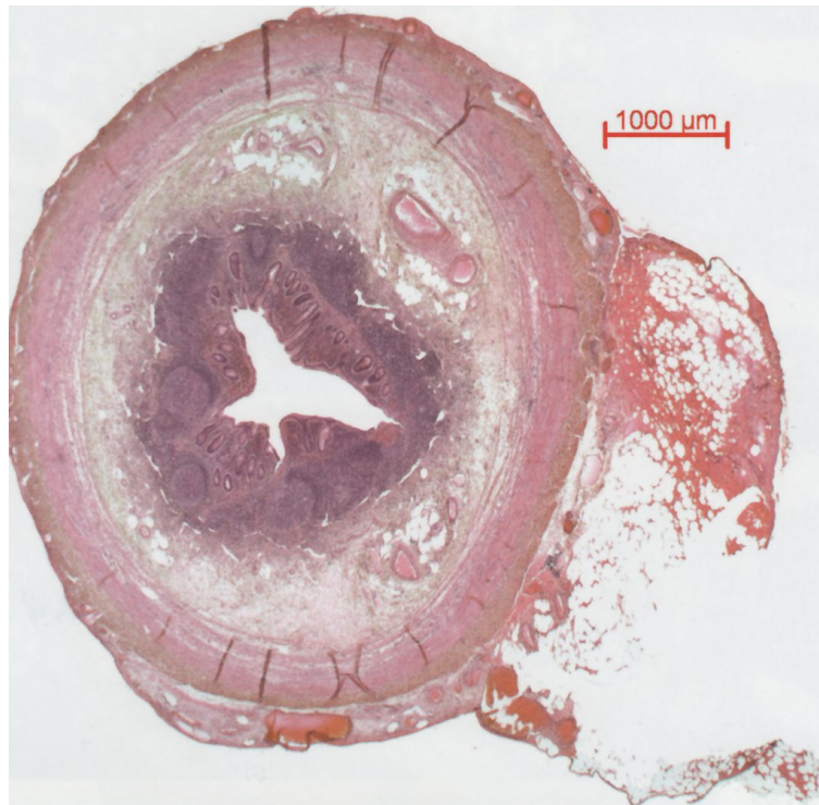
Figure 2. Vermiform appendix in cross section in histologic hematoxylin/eosin staining

function. Appendiceal crypts are irregular in depth and structure. Lamina propria (lat. lamina propria mucosae ) runs between individual crypts containing a high abundance of lymphoid nodules and a well-developed plexus composed of neuroendocrine cells, Schwann cells, unmyelinated never fibers, and neurons (6).