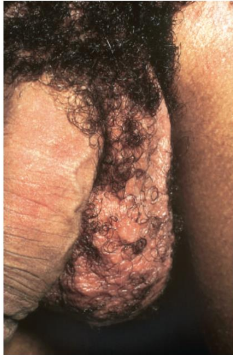
Figure 3. Left varicocele in an adolescent boy (15)